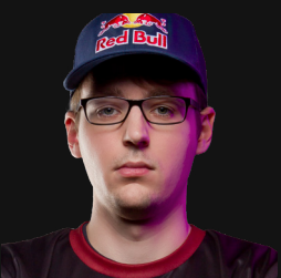
Artur "Nerchio" Bloch